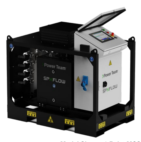
Model Shown: 8 Point MCS