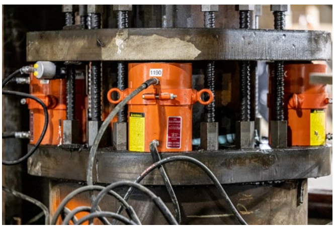
The Power Team Motion Control System (MCS) can be used in many hydraulic applications where load position is critical, requiring cylinder synchronization.